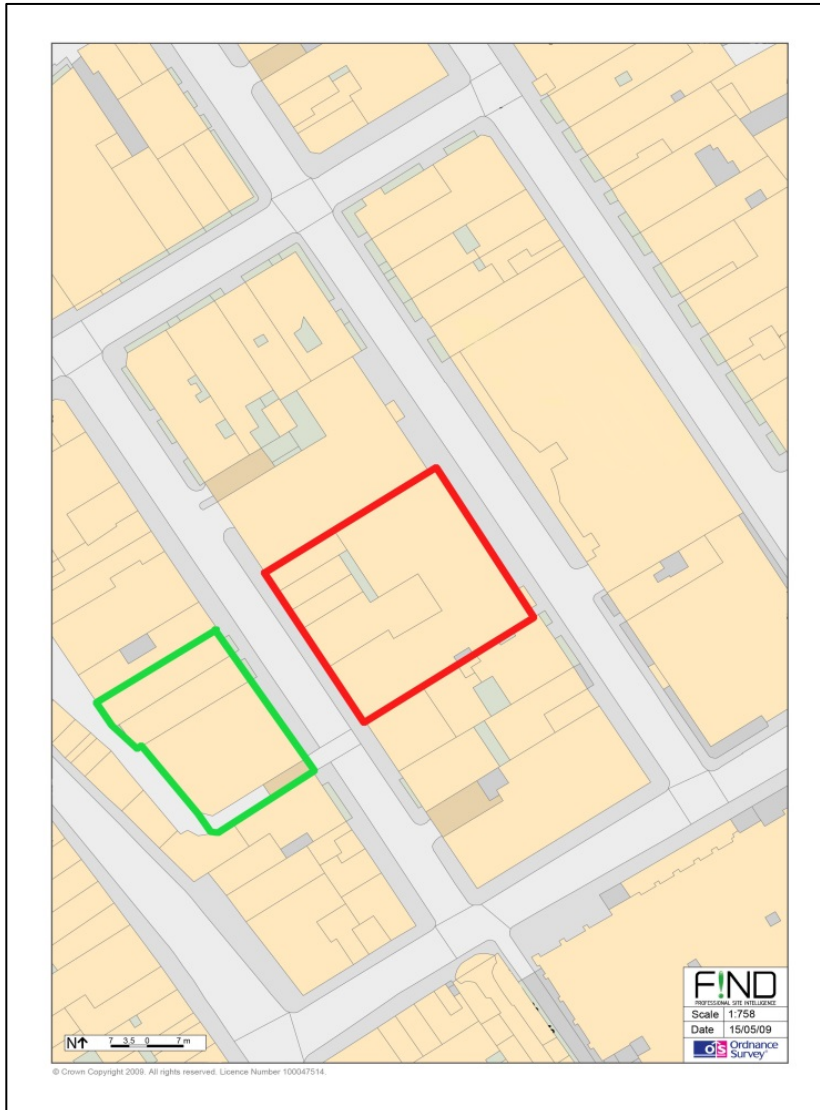
Plate 01 – Ordnance Survey of Site and Neighbour