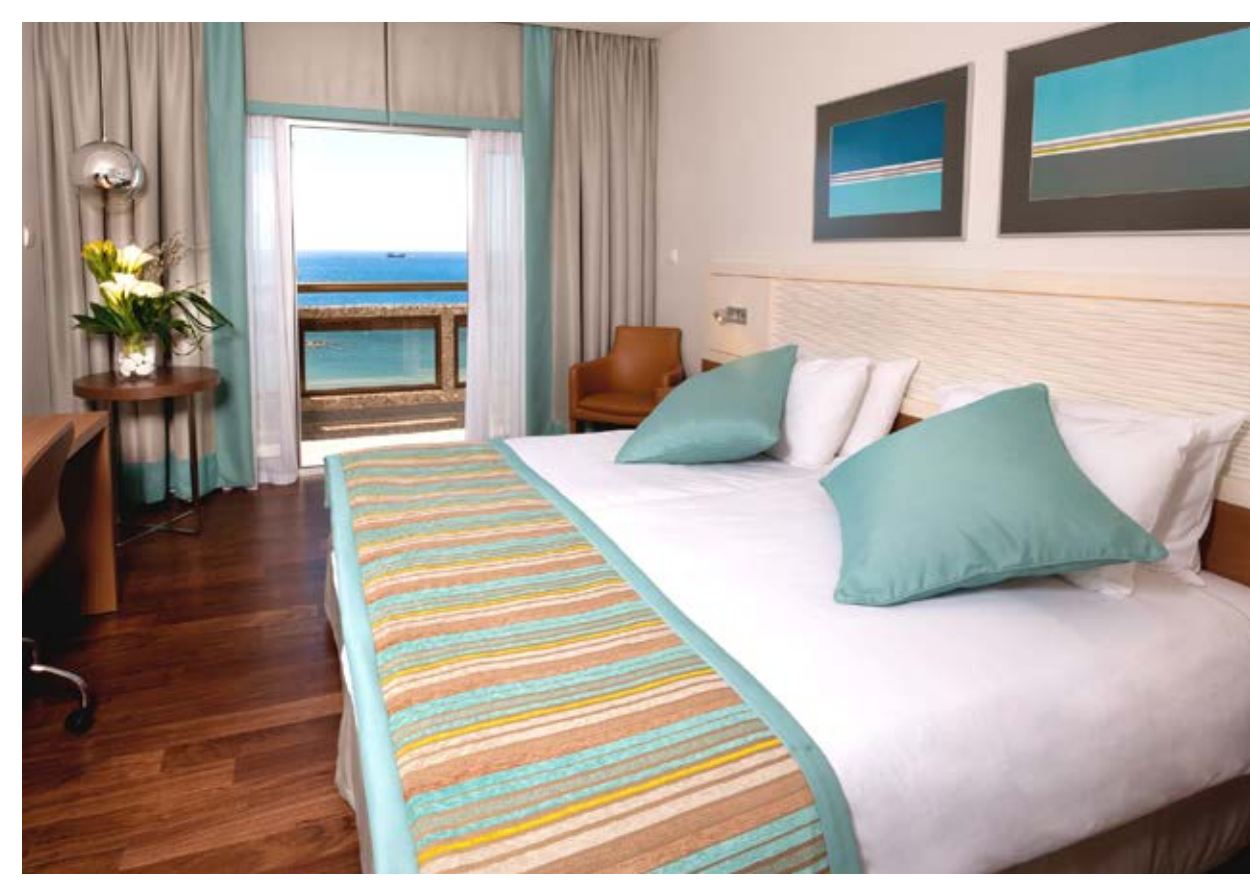
DELUXE SEA VIEW